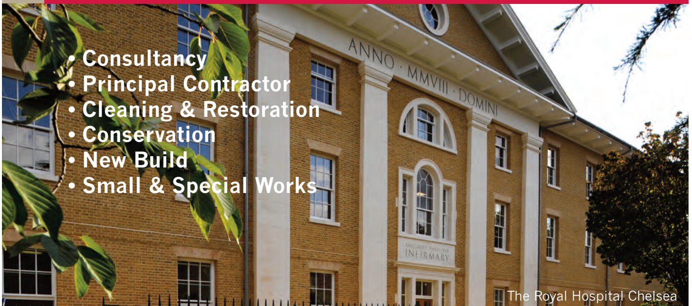
The Royal Hospital Chelsea