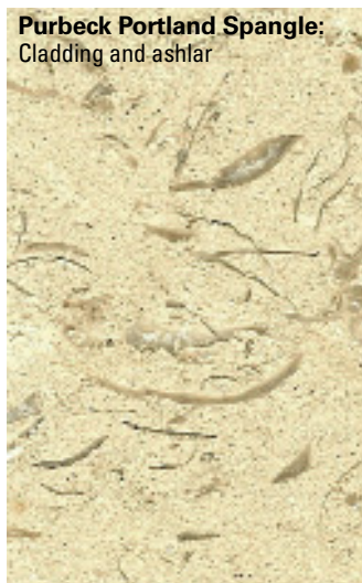
Purbeck Portland Spangle: Cladding and ashlar