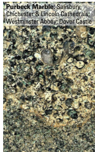
Purbeck Marble: Salisbury, Chichester & Lincoln Cathedrals; Westminster Abbey; Dover Castle