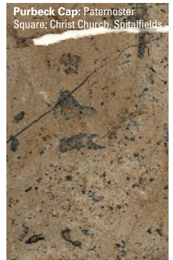
Purbeck Cap: Paternoster Square; Christ Church, Spitalfields